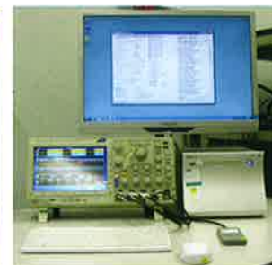
以上圖片是有關檢測Qi標準的儀器