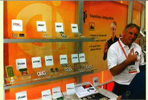
在2013美國消費電子產品展 (CES 2013)上展示了多種無線充電板

隨著智能手機、平板電腦和其他便攜或移動等電子產品的普及，對電源需求亦同時增加。無線充電技術將會成為熱門潮流焦點，亦同時為業界帶來新的機遇。現時智能手機認同是無線充電最廣泛應用的產品，在2013美國消費電子產品展 (CES 2013)上展示了多種無線充電板，可以直接對手機等裝置進行無線充電。更有汽車廠商推出新型號的汽車系列，更內置了Qi標準的充電裝置，供同樣具有Qi標準的手機充電。可見未來無線充電模式是有一定的發展空間，隨著日後推出再一步的標準及技術發展，無線充電將會更廣泛被應用到很多家庭電器。例如攪拌器、電飯煲等等將來也可以透過無線充電技術提供電源。